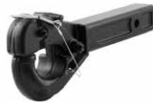
Receiver-Mount Pintle Hook (2" Shank, 20,000 lbs., 2-1/2" Lunette Rings)