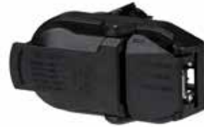
OEM Replacement Dual-Out- put 7 & 4-Way Connector (Plugs into Any US CAR)