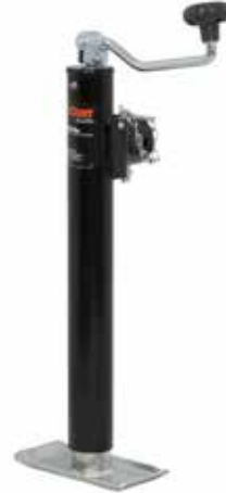
Pipe-Mount Swivel Jack with Top Handle (5,000 lbs, 15" Travel)